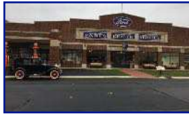
Message from the Executive Director Page 2