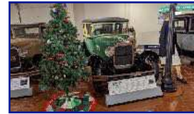
2022 Christmas in The Museum Page 7

The Quarterly Newsletter of the Model A Ford Foundation, Incorporated