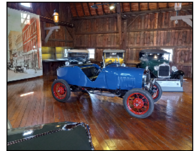
Featuring Fords from 1903 to 1953