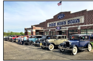
Wisconsin Model A Club visited The Museum May 23

The Quarterly Newsletter of the Model A Ford Museum