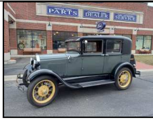
Volkmer Donation Henrietta - 1929 Blindback