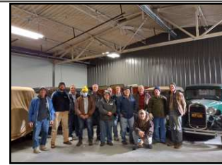
Thanks to the Grape Country A's! We've moved into a new offsite storage area.

The Quarterly Newsletter of the Model A Ford Museum