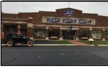
Messages from the Museum President and Executive Director