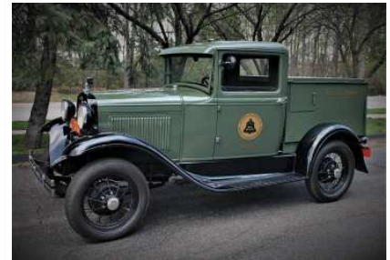
Beautifully restored Telephone Truck, recently acquired by the Model A Ford Foundation, Inc.