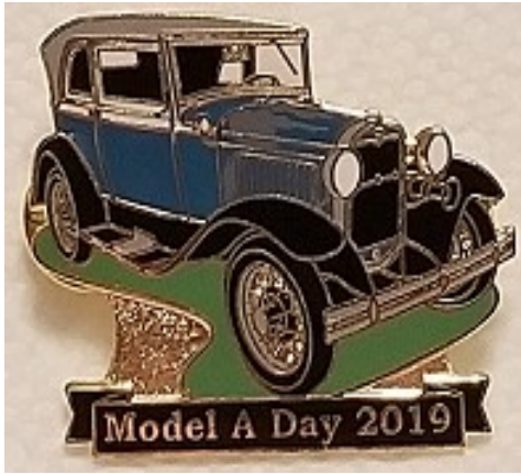
Model A Day IX Commemorative

The ninth annual Model A Day event was held September 20-21, 2019 on the campus of the Gilmore Car Museum in Hickory Corners, Michigan. The Model A Day festivities, sponsored by the Model A Ford Foundation, Inc. (MAFFI), are held each year on the third Saturday in September. This year's event was the largest to date – with an estimated 275 Model A's and over 800 participants in attendance. The theme for this year's Model A Day was “ Unique and Original Model A's. ”