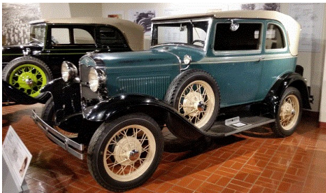
1931 A-400 Convertible Sedan

The Model A Ford Museum and the many other Gilmore Car Museum buildings were all open for Model A Day – providing the opportunity for visitors to enjoy over 400 different antique vehicles. Model A Day 2018 also provided the setting for the MAFFI Model AA Stake Bed truck to make its debut. This vehicle, outfitted with passenger bench seating and a set of folding stairs, was used to transport Model A Day visitors around the Gilmore 90-acre campus.