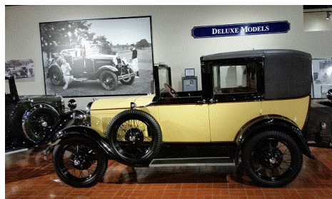
Rare 1928 Town Car Prototype

A special display of Tim Kelly's fabulous collection of three Model A Town Cars and two Town Car Deliveries was one of the featured highlights of the event. These rare vehicles were assembled for a one-day showing and presented the opportunity to see all five vehicles together at one time – an impressive exhibit probably never to be repeated.