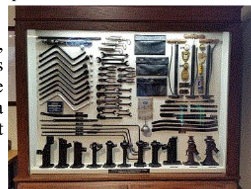
Model A Tool Display