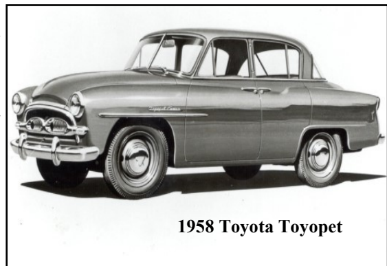
1958 Toyota Toyopet

When Eiji Toyoda toasted Ford CEO Phil Caldwell at a dinner in 1982, the now-President of Toyota referred to his company's rapid rise to world-class status. "There is no secret to how we learned to do what we do, Mr. Caldwell," Toyoda told his Ford counterpart. "We learned it at the Rouge."