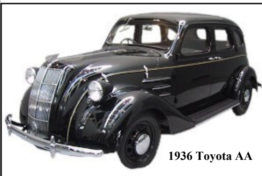
1936 Toyota AA